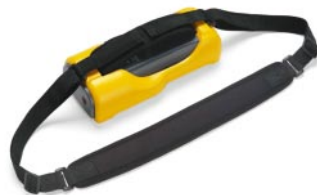
Optional SH 100 Shoulder Strap

Fluke. Keeping your world up and running.