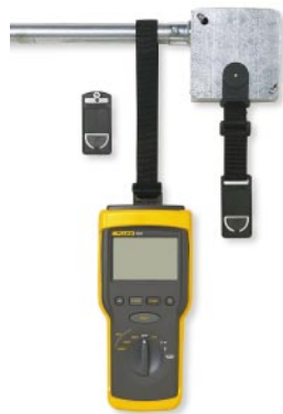
Optional TPAK Meter Strap and Magnet Hanging Kit